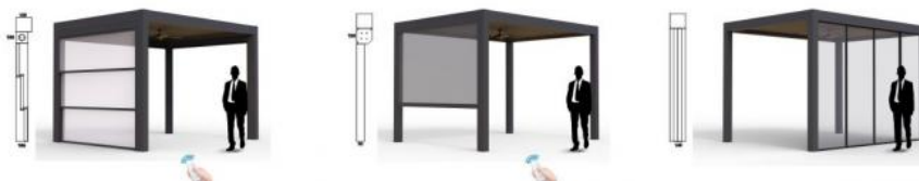
Side with different products

Our products are with the patents from China Intellectual Property Administration ,also with a lot of certifications of honor.Our products are patented ,which means that our products mould belongs to us ,we have the copyrights of the products ,our products are with our own good thoughts of our designers ,the design is very professional ,reasonable ,scientific ,with the best quality !